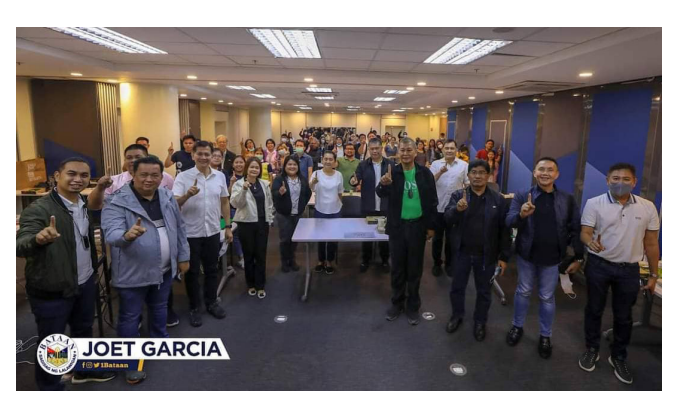
BATAAN - PhilHealth Konsulta, Universal Health Care, and vaccination updates highlighted the recent Provincial Health Board Meeting in Dinalupihan, Bataan.