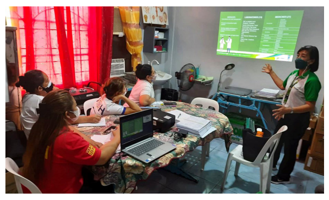
BULACAN – PhilHealth Konsulta and Universal Health Care orientations and discussions with partners and members.