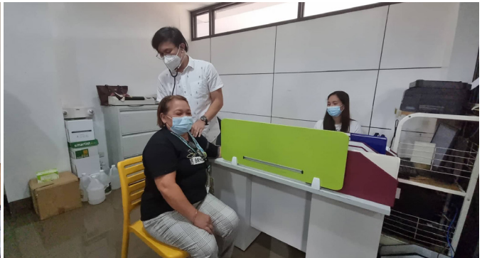
Medical check-up of PhilHealth members availing of Konsulta benefit package at the DOH-Treatment and Rehabilitation Center in Rataan